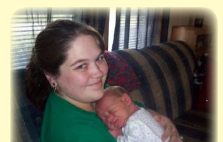
Mom and baby relax at home