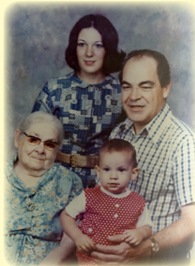
Four Generations of Steiners 1972